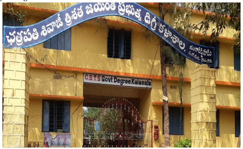
Handbook 2023-24. Jangareddigudem

CSTS Govt. Kalasala, Jangareddigudem is one of the biggest colleges in the west Godavari District with its well Structured buildings, an auditorium with the latest equipment which can accommodate 200 members, a Gymnasium, fitness center. Computer Lab with AC provision, well equipped labs, a spacious Library with thousand of books on various subjects, a vast playground with provision for Cricket and Tennis games, hostels, Canteen, cycle stand,, waiting room for girls, teak trees on the premises and beautiful gardens. Chatrapati Shivaji Statue and Murty Raju statues are built on the campus and the entire college campus is enclosed by compound wall on four sides. Huge play grounds and gymnasium are the added advantages to the college offered by the College. The College has produced a number of National/ International players and coaches. Our Students bagged many prizes at the University, Zonal and National level games and sports.